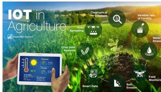
Fig.1.2 IOT used in Agriculture

Agriculture is India's economic development's most important pillar. Climate change is the most important boundary that conventional farming faces. Overwhelming flooding, the most extreme hurricanes and warm winds reduced rainfall, and other climatic shifts are among the many consequences. As a consequence of these considerations, performance suffers greatly. Climate change often has natural effects, such as periodic shifts in plant lifecycles. In order to increase productivity and reduce boundaries in the farming sector, creative creativity and Internet of Things strategies were needed. The Internet of Things (IoT) is now shifting its focus to the agricultural sector, enabling farmers to face the immense obstacles they face. Using IoT, farmers may gain access to a wealth of data and knowledge regarding future trends and innovation. Since global agriculture is becoming more industrialized, it is critical to establish agricultural interdepartmental cooperation at the same time. Agricultural intercolumniation has resulted in a positive change in global agriculture. As far as agricultural improvement is concerned, rural intercolumniation can be a major impediment to agricultural progress and reform and a cornerstone for sustaining stable and sustainable economic growth. We've been concentrating on agricultural data gain and framework improvement for a while now. Exceptional results had been shown in rural system improvement after several years of challenging efforts.